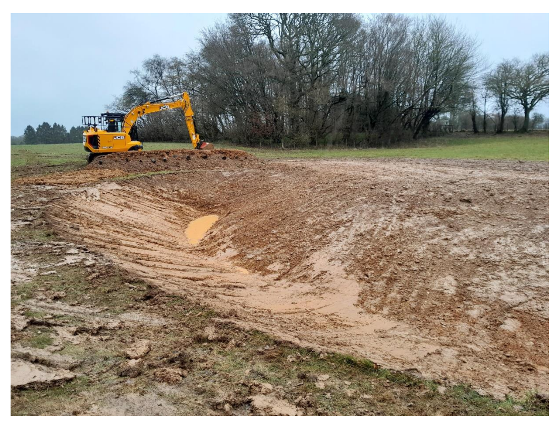
Plate 5. Completed soil strip and reduction (looking North)