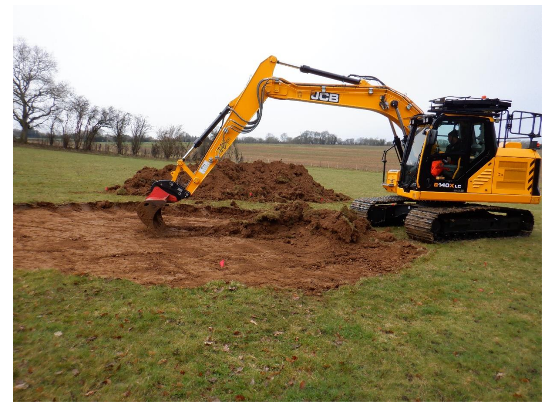
Plate 2. Topsoil strip (looking South)