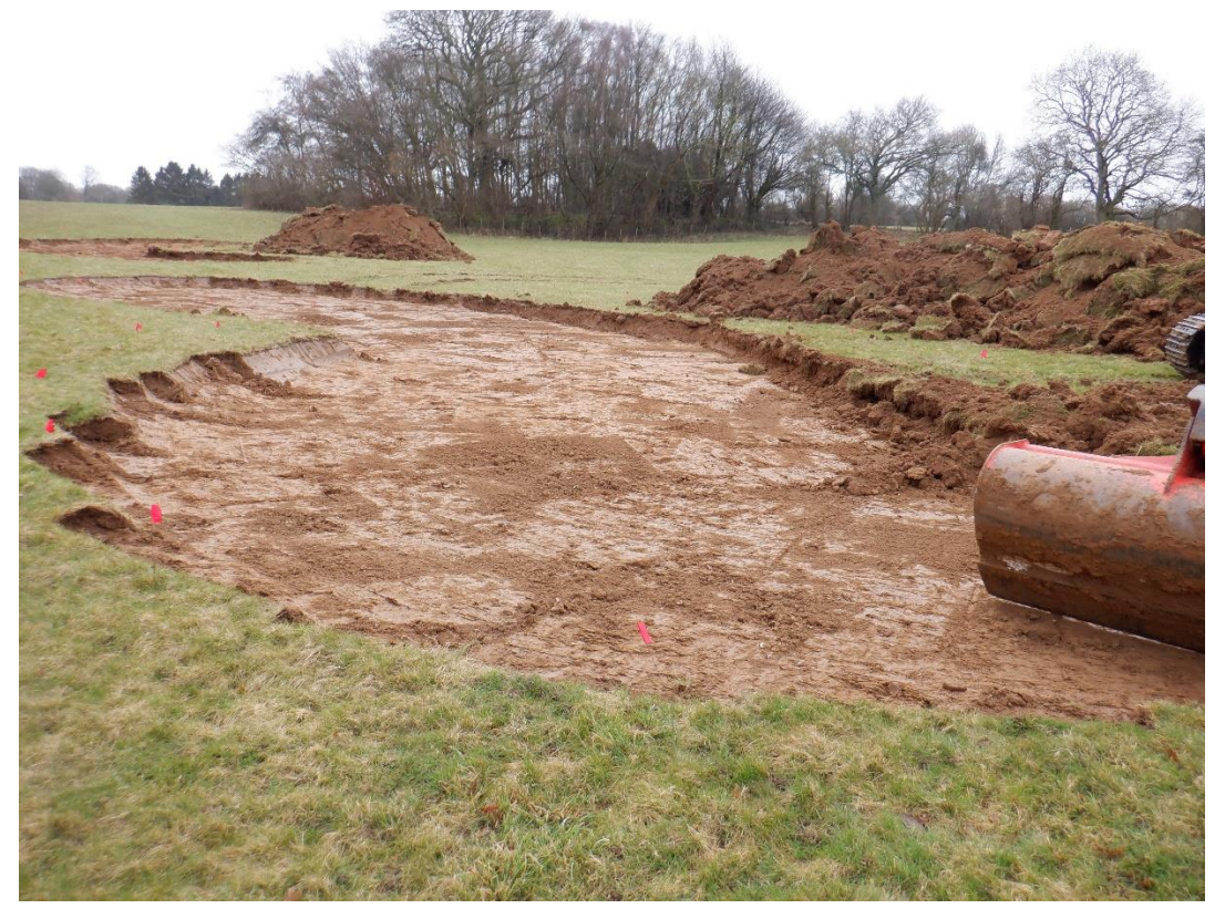
Plate 4. Typical section after topsoil and subsoil strip (looking NW)