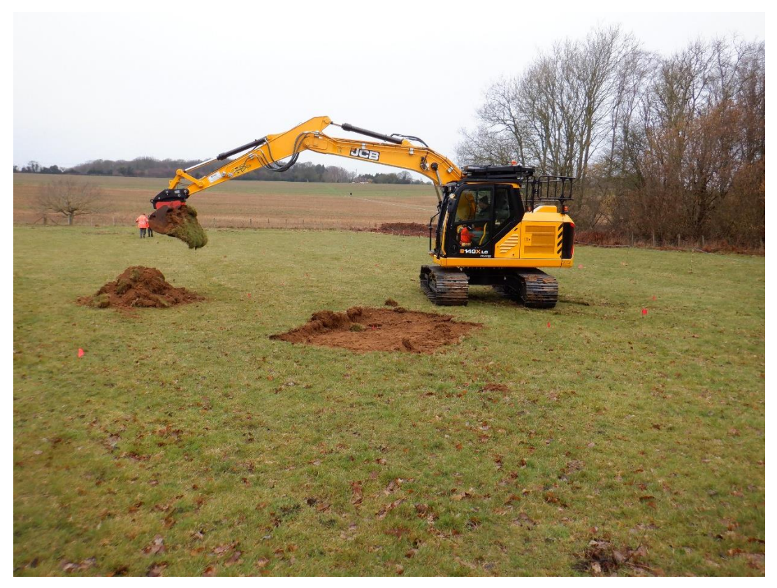
Plate 1. Topsoil strip (looking NNW)