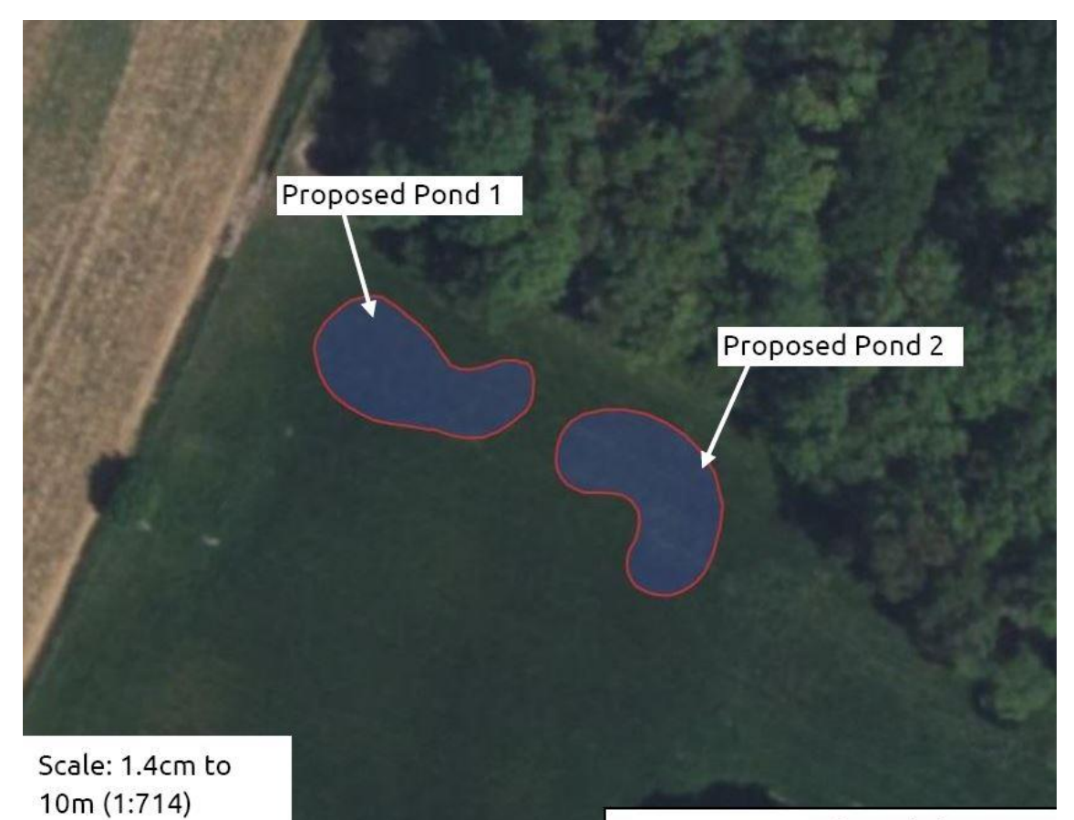
Figure 3. Proposed ponds