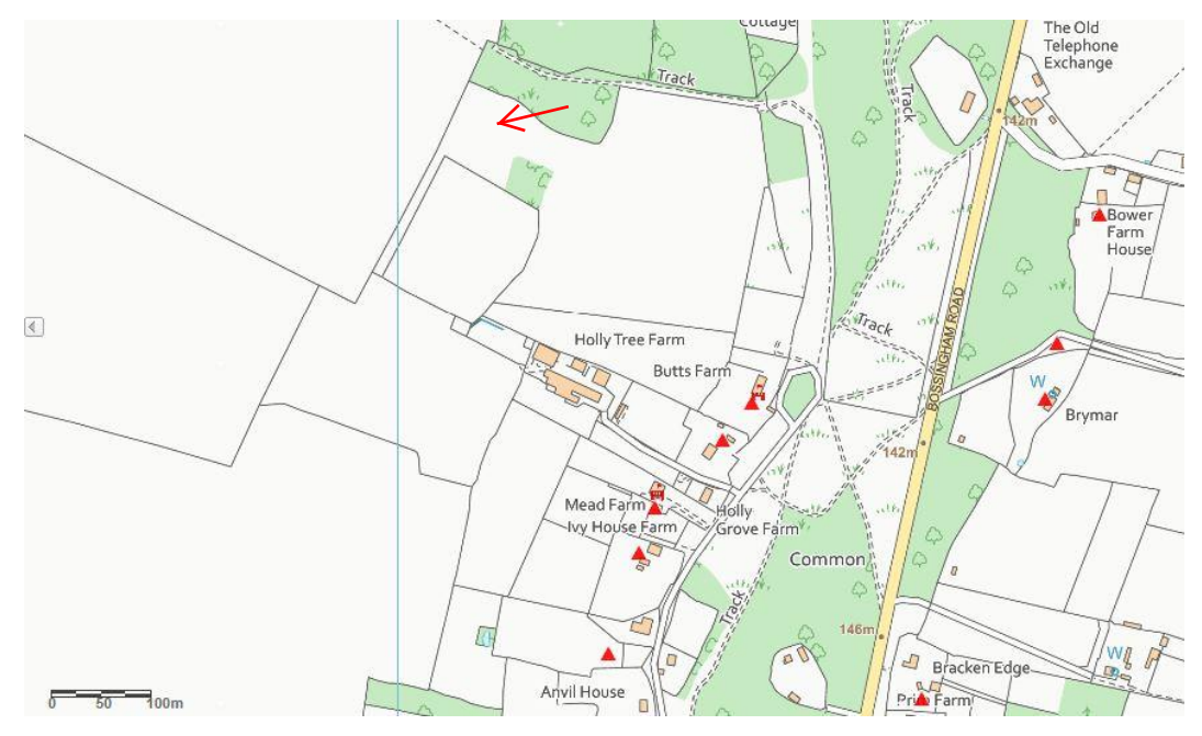
Figure 1. Site location (red arrow)