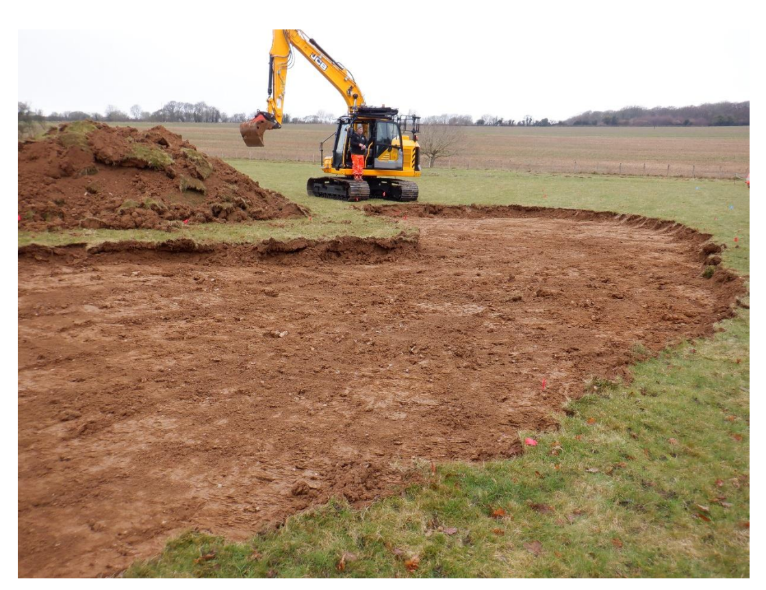
Plate 3. Topsoil strip (looking North)